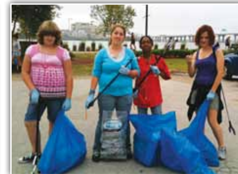
Troop 1294 participated in the Coastal Cleanup. They netted about 300 pounds of trash including several tires!