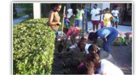
Lem Turner Circle Church of Christ Cluster built a flower bed, planted a tree and flowers.