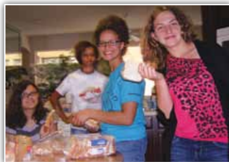
Troop 127 made over 150 peanut butter and jelly sandwiches and gave them to the Beaches Mission House at Jacksonville Beach.