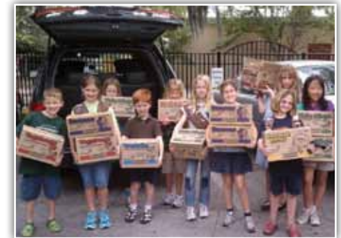
Troop 1520 collected 167 boxes of Girl Scout cookies as "Gifts or Caring" for the St. Francis House homeless shelter and soup kitchen in Gainesville.