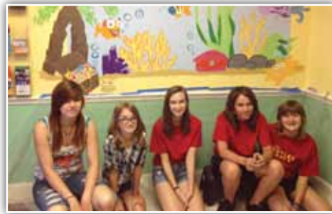
Girls from Troops 1012 and 171 in Sawamish Service Unit designed and painted a mural on the wall of an interview room at the Children's Advocacy Center.