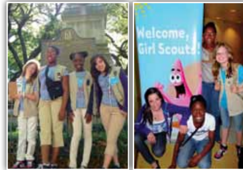
Troop 1101 from Crossroads Creek REALLY likes to travel! They attended the Girl Scout weekend at the Nickelodeon Hotel in Orlando, made their first trip To the Juliette Gordon Low Birthplace in Savannah, and two girls from the troop attended Girl Scouts Rock the Mall in Washington, DC as well!