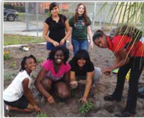
Troop 58 from Jacksonville planted a vegetable and flower garden for Southside Middle School - they also worked with the Park Rangers of Manatee Springs to clean Clay Landing!