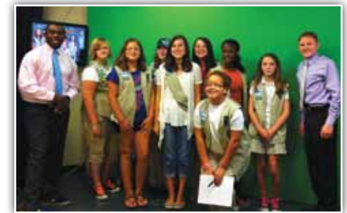
Troops from Lake Butler went to KISS 105.3 and WCJB Channel 20 News as part of their MEdia Journey over the summer. They got to see how the radio and TV stations work –including being guests in the studio while the noon news was being recorded live.