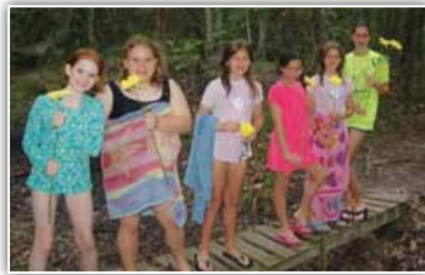
Troop 236 from Gainesville bridged from Juniors to Cadettes.