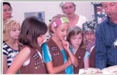
Troops 1848 and 1948 learned about plants, how to make plant presses, and to press and mount plant specimens. They demonstrated their new skills during the Earth Day event at the Florida Museum of Natural History.