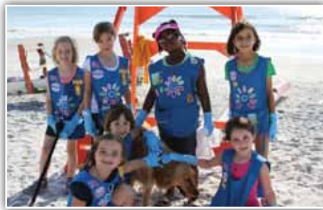
Troop 612 from Riverside Presbyterian Day School gathered on Jacksonville Beach for a beach clean up. They even managed to "adopt" one of the lifeguard's dogs.

To feature your accomplishments here, email "Shout Outs" to communications@girlscouts-gateway.org or send to the communications department at the Jacksonville Service Center, 1000 Shearer Avenue, Jacksonville, FL 32205.