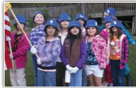
Troop 336 in Nassau County Service Unit held a Flag Ceremony at Camp Kateri. Troop 336 also participated in Nassau Service Unit's World Thinking Day event. Nassau Service Unit adopted a portion of the beach to maintain in honor of Girl Scouts 100 birthday. Several Troops not only cleaned that area this weekend but, they camped in the youth camping area of Fort Clinch.