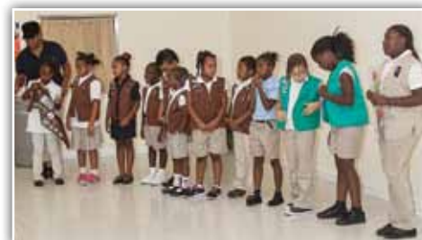
14 girls from The Promise Academy bridged from Daisies to Brownies, Brownies to Juniors, and Juniors to Cadettes.