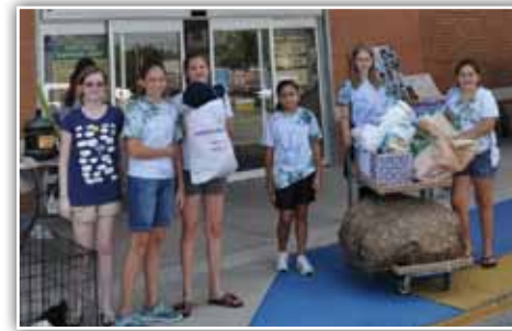
Troop 1057 assisted Ana's Angels at a pet rescue and adoption day at the Mandarin Petco. The girls helped by walking, holding, and caring for the dogs and cats. They donated cash and supplies to help foster the animals.