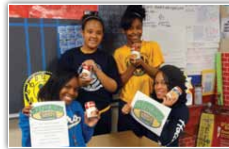
Troop 1210 collected canned goods at Faith Christian Center the week before the Super Bowl, for the annual Souper Bowl of Caring. They donated 156 food items to the Second Harvest Food Bank.