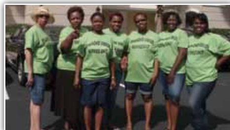
Diamond Jubilee Service Unit Coaches enjoyed a retreat to Cinnamon Beach!