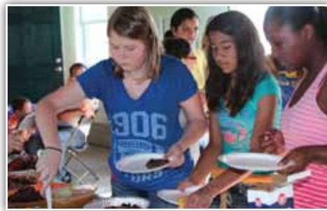
Troop 633 earned their New Cuisines badge! They cooked some amazing dishes, and had a lovely dinner party at their Court of Awards ceremony.