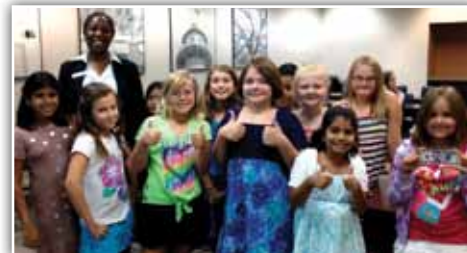
Troop 1058 from Julington Creek Elementary participated in a park cleanup. This year they're enjoying being Brownies!