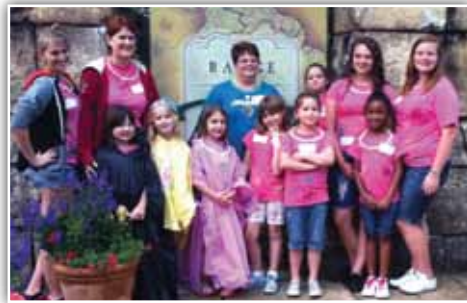
Troop 1053 got to experience the Jacksonville Zoo at night during a Zoo lock-in for their end-of-year celebration.