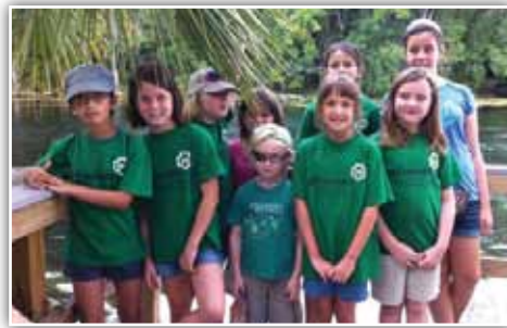
Troop 383 of Orange Park used some of their Cookie Money to fund this day trip to Silver Springs - to learn about the Florida ecosystem - which fit right in with their WOW Journey.