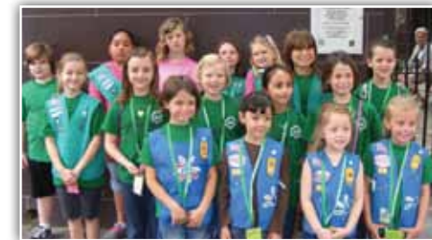
Troops 348, 383, and 95 from Orange Park visited Savannah, GA; and the birthplace of our founder, Juliette Gordon Low.