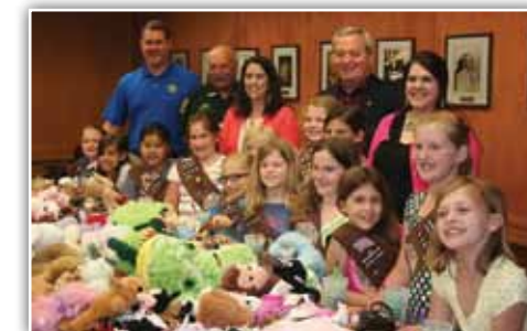
Troop 1165 from Hickory Creek Elementary School, collected stuffed animals for the St. Johns County Sheriff's Office Cuddly Care project. The girls presented more than 150 cuddly creatures to the officers for distribution to local shelters, adult care facilities and various locations where they can brighten someone's day.