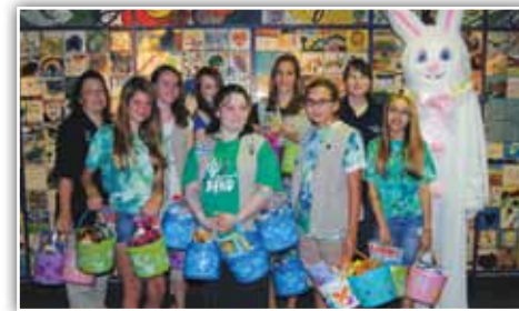
Troop 519 of Live Oak collected, filled, and delivered Easter baskets to the University of Florida pediatric oncology department at Shands.