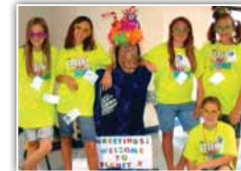
Troop 811 had a blast Exploring Planet X - an event they hosted for Okeweno service unit. Brownies enjoyed lots of otherworldly activities. The girls from Troop 811 also participated in a roadside cleanup along highway 315C for Earth Day.