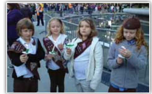
Troop 306 celebrated 100 years of Girl Scouts with a candle lighting ceremony in Savannah.