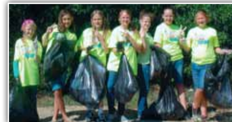
Troop 63 from Orange Park travelled to Disney World to "Bridge into the next Century."