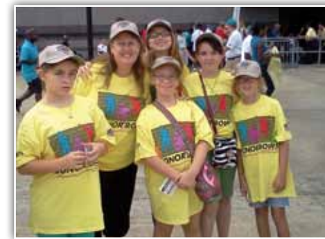
Troop 466 from Mandarin Meadows service unit went "All In" and participated in the Jaguar/ Texans football game – they had a great time watching Jaguar football!