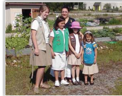
Troops at Enterprise Learning Academy joined with the Association of Women in Construction to build raised garden boxes for Burmese Refugees. The boxes were constructed by the girls and placed in the Jacksonville Public Garden.