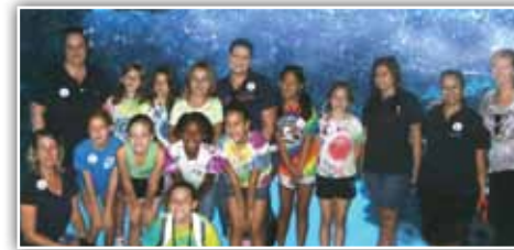
Troop 1337 from St Johns, Florida attended a sleepover at Sea World Orlando and slept with the dolphins! The fun included a pizza dinner, continental breakfast and admission to the park the following day. There are other creatures to choose also - manatees, penguins, coral reefs, polar bears or beluga whales!