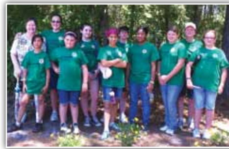
Troop 63 planted daisies at North Fork in honor of the 100th Anniversary of Girl Scouting.