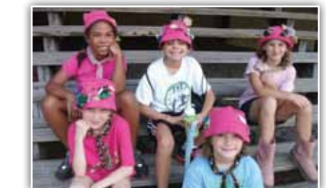
Troop 665 went Horseback Riding at Diamond D Ranch. The girls received a lesson on grooming and a 1-hour trail ride. They also had a great time at the Whispering Pines Service Unit Campout at Kateri- For some of the girls, this was their first camping experience!