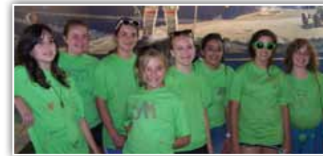
Troop 909 enjoyed their biggest/best trip yet - visiting Washington DC for the 100 year celebration, visiting the National Air and Space Museum and Rocking the Mall with thousands of sister Girl Scouts! Troop 909 also enjoyed their service unit campout at Seminole Springs, sharing the fun with a troop from St Augustine.